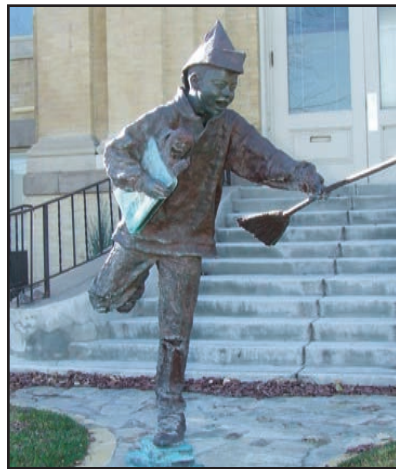
Liberty through Imagination by Douglas Warnock