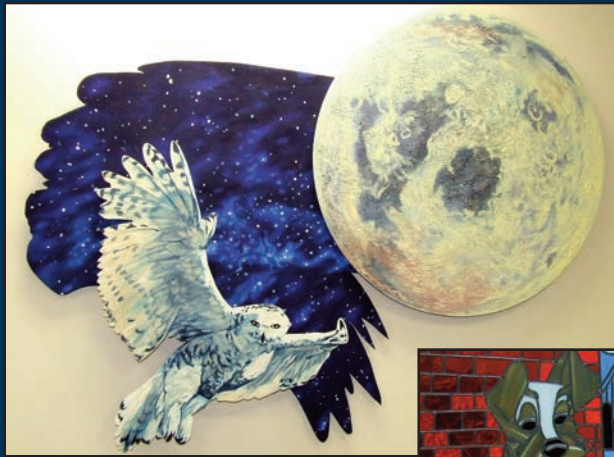
Owl & Moon sculpture by Tim Norton