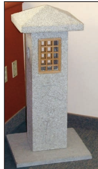
Japanese Carved Welcoming Lantern