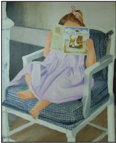
Untitled girl with book by D.A. Pack