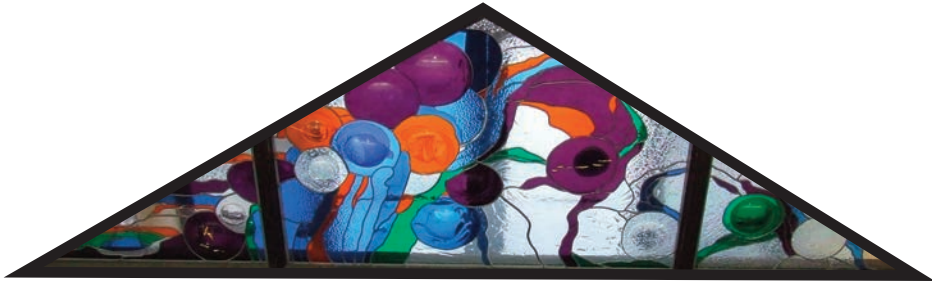
Stained glass entrance by Judy Cantrill