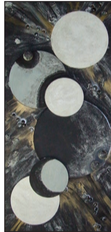
Untitled planets sculpture by Sheryl Christensen