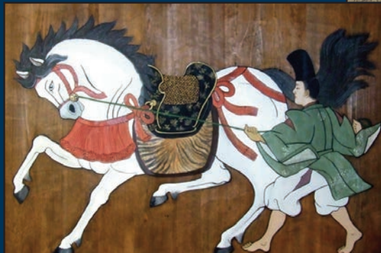
Japanese Ema unknown artist

M A R S H A L L P U B L I C L I B R A R Y