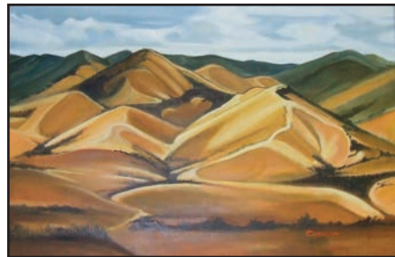
Pocatello Hills by Viola Cordova